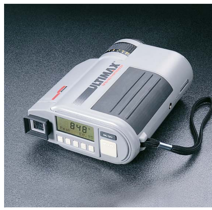
Models UX 10P, UX 20P, and UX 40P

Continuing in that light, the ULTIMAX Plus Series of handheld non-contact thermometers - consisting of six models to cover nearly every temperature measure-ment application - includes powerful features to deliver high quality performance. With through-the-lens viewing, all you have to do is aim and measure. Sophisticated microprocessor based electronics allow simple push-button selection of emissivity, response time and measuring mode. Single lens reflex (SLR) optics and a reticle that precisely defines the measured area deliver ultimate accuracy. Both analog and digital outputs are standard features and the temperature values are displayed both in the viewfinder and on the external LCD. Reliability is enhanced by surface mount technology, DC operation and an optical system that does not require optical modulation techniques such as mechanical choppers.